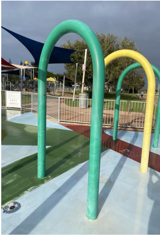
Water Park Painting Renewal