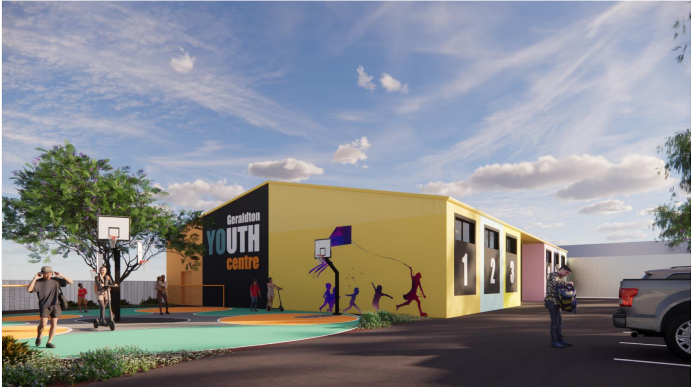
Geraldton Youth Centre Upgrade (Former Rocky's Gym)