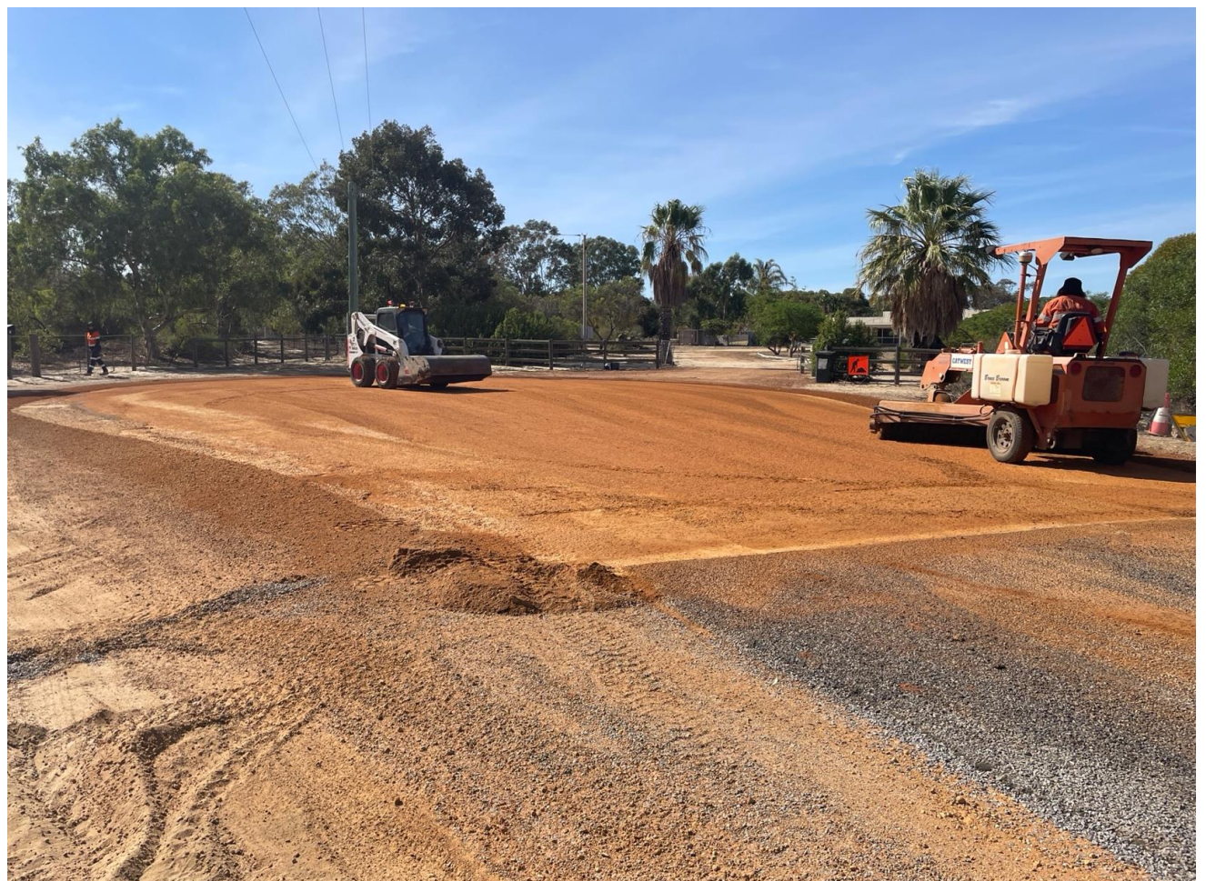
Example of Resurfacing Works – Ridgeway Close – Moresby 2024