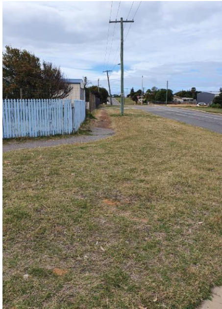
Crowther Street Path Renewal