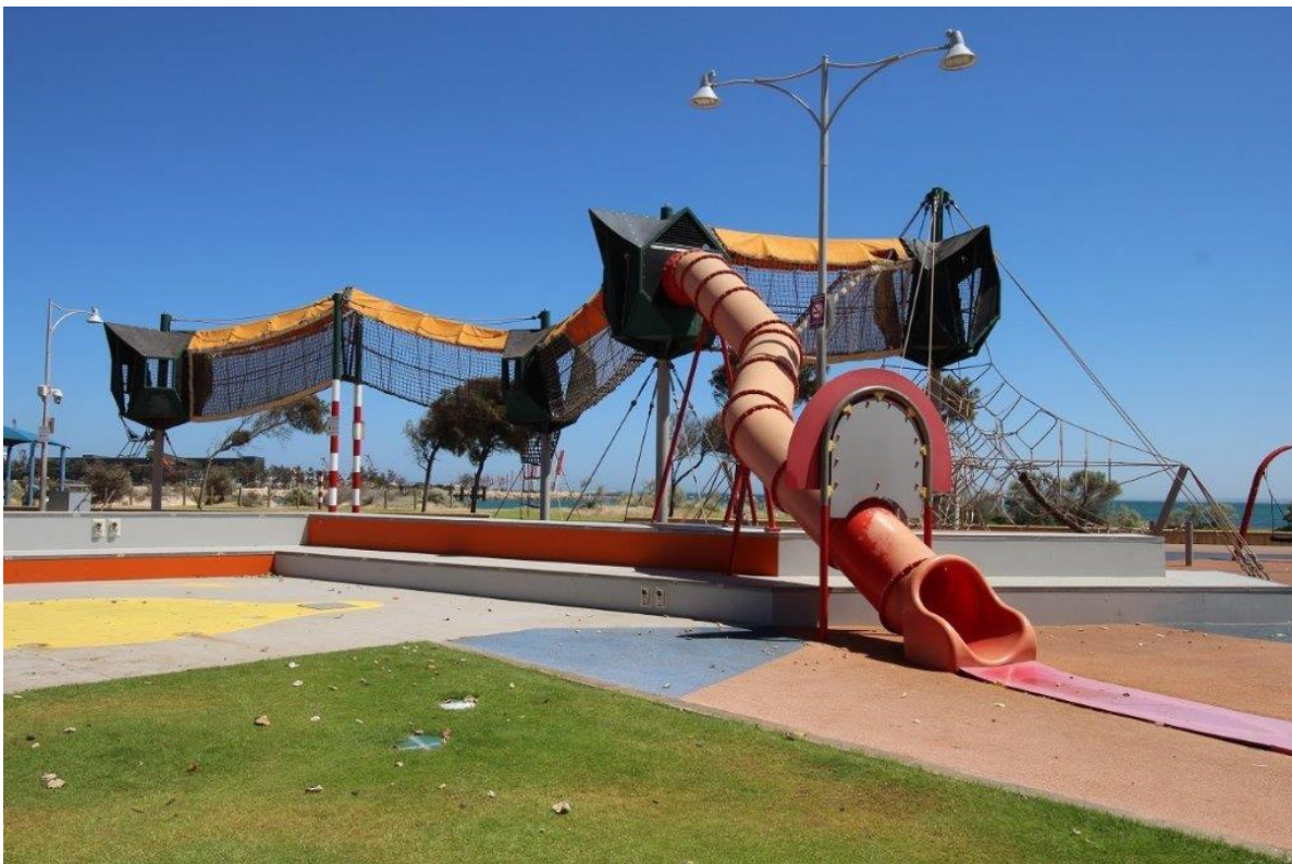
Stow Gardens Playground Renewal