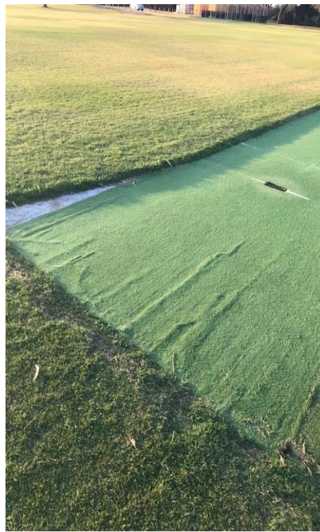
Eadon Clarke Cricket Pitch Replacement