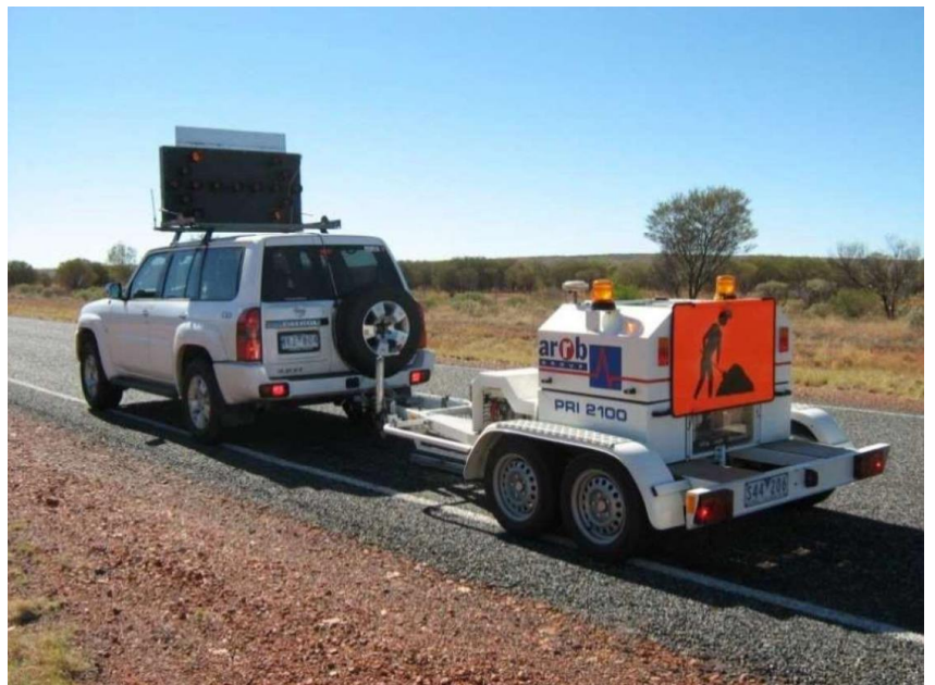
Example of Pavement Testing being conducted.