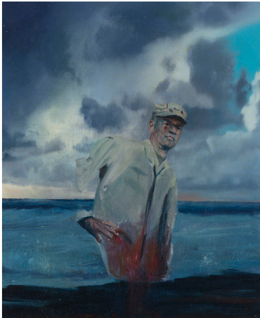
Robert Cleworth, Thinking of Cornelisz as a Contemporary , 2009/10, Oil on canvas, 23 x 19.5

Facilitate meaningful and relevant arts engagement opportunities which increase engagement of the community with the City of Greater Geraldton Art Collection, exhibitions and programs facilitated by the Geraldton Regional Art Gallery whilst strengthening and developing the regional galleries network.