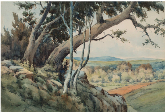
James Goatcher, The Swan Valley , c1950, Watercolour on paper (CGG Ac. No. 024).

Improve, promote and conserve the City of Greater Geraldton Art and Public Art Collections.