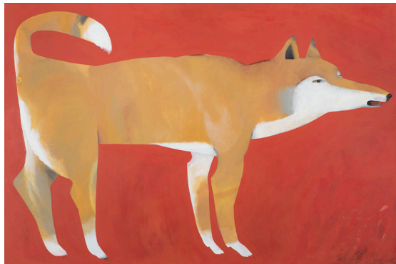
Moira Court, Howl , 2011, Acrylic, wax oil, pastel and charcoal on canvas, 101 x 152cm (CGG Ac. No. 453).

Contribute to the vibrancy of the City of Greater Geraldton and the quality of life in regional Western Australia, attracting visitation and economy to the Midwest region.