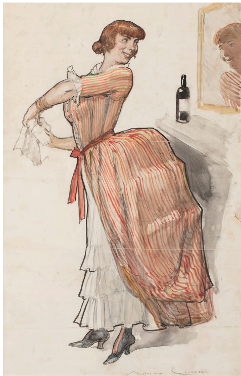
Norman Lindsay, My Reflection , c1910, Watercolour on paper, 40 x 36cm (CGG Ac. No. 182).

Improve, promote and conserve the City of Greater Geraldton Art and Public Art Collections.