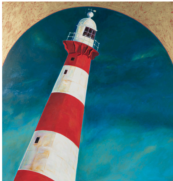
Tim Williams, Fallen Icon , 1994, Oil on canvas, 176 x 174cm (CGG Ac. No. 005).

Contribute to the vibrancy of the City of Greater Geraldton and the quality of life in regional Western Australia, attracting visitation and economy to the Midwest region.