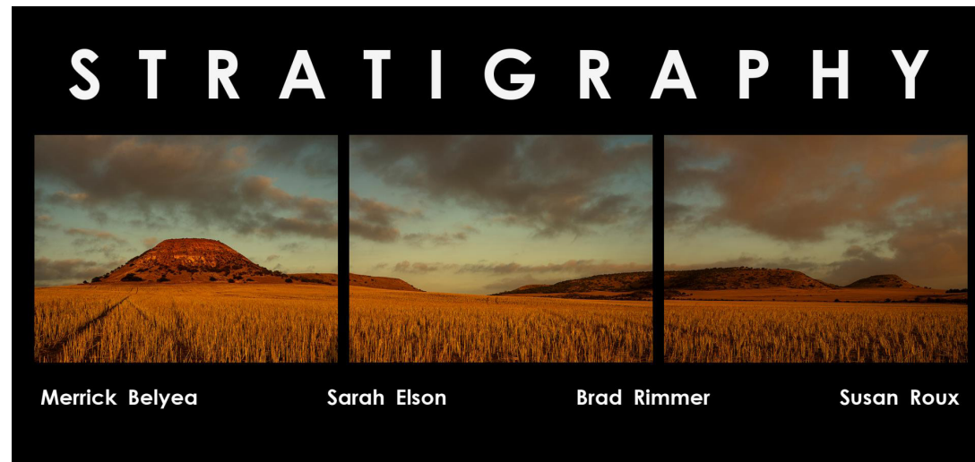
Stratigraphy , Art Collective WA Artists, 14 May - 26 June 2022, GRAG.