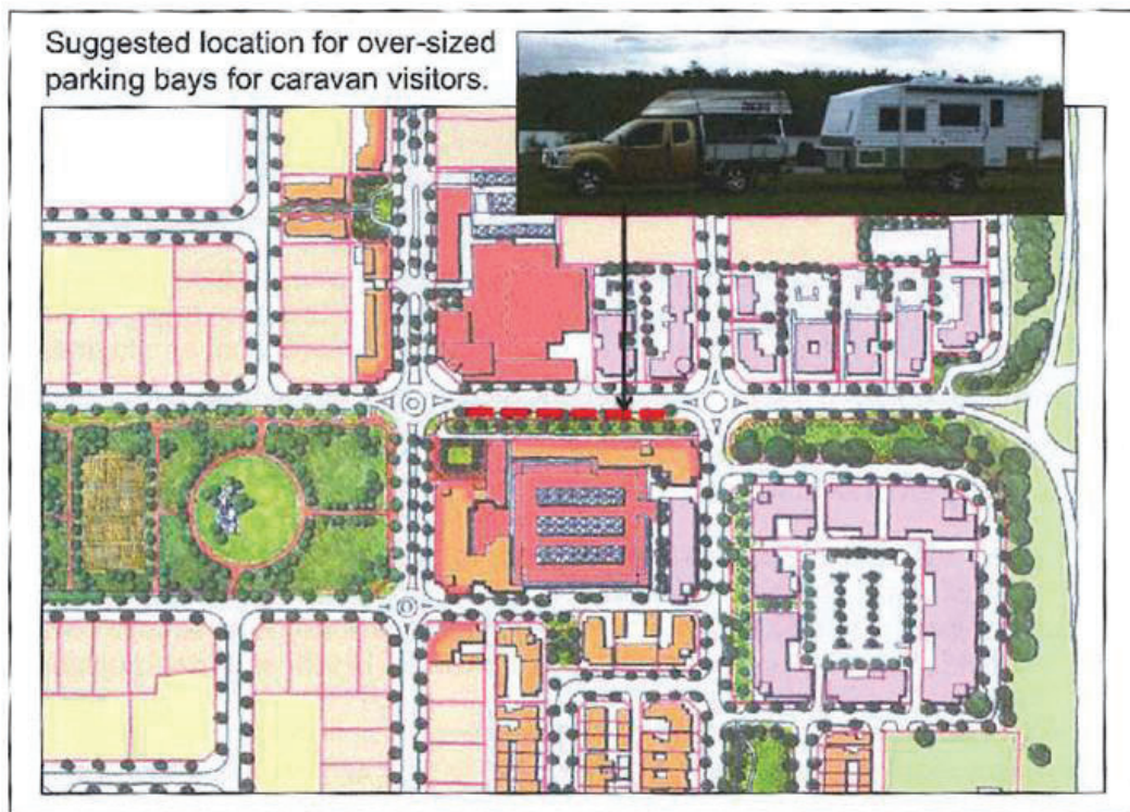
Figure 20: Visitor bays for caravans