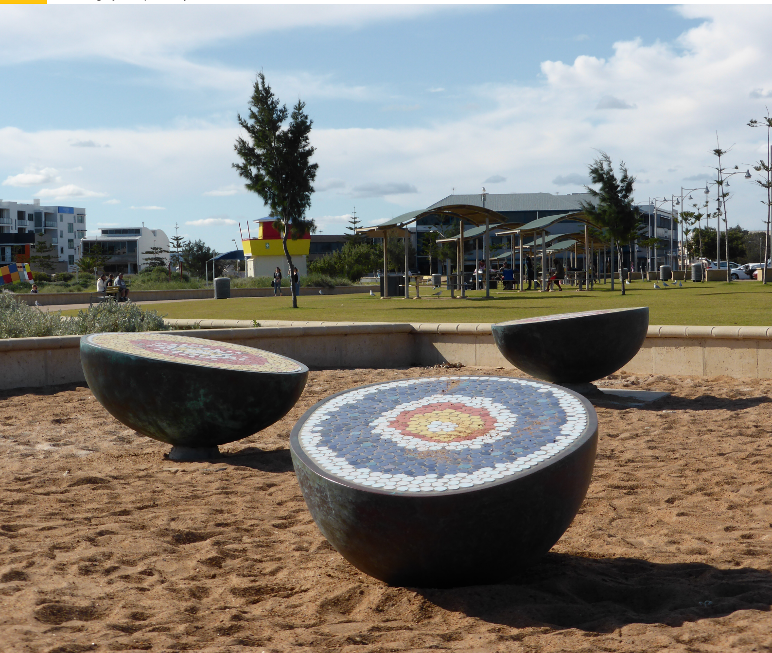
IMAGE: Ilgarijiri Sculpture, City of Greater Geraldton

This Strategy provides an outline for current and future heritage activities in the City of Greater Geraldton. It does not dismiss or exclude any new proposed projects or initiatives considered in the future; however, these should be assessed within the parameters of the aims and actions of this Strategy.