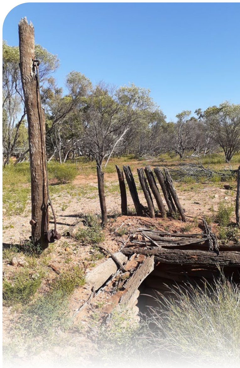
BELOW: Well 34, De Grey - Mullewa Stock Route

Yes. Inclusion on the State Register of Heritage Places does not prevent an owner or leaseholder from making changes to their property. Owners or leaseholders should discuss any potential development ideas