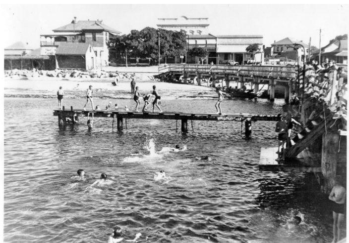
IMAGE: P825, children swimming off the jetty Undated