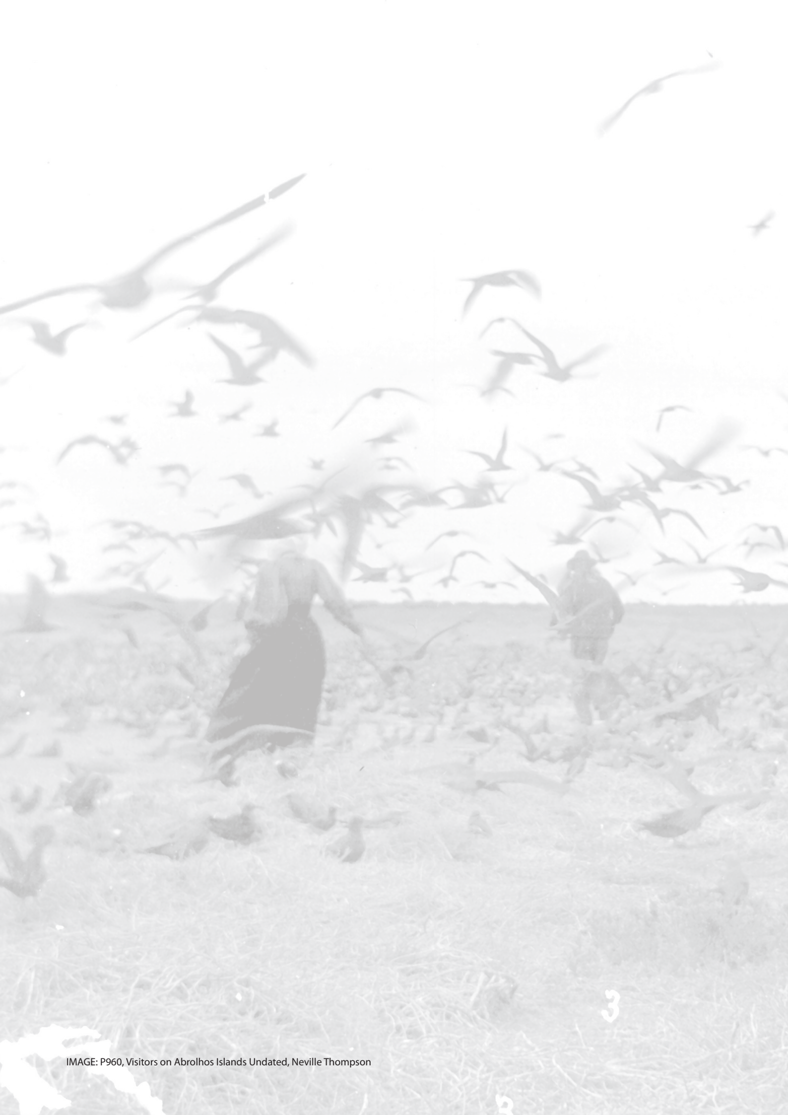
IMAGE: P960, Visitors on Abrolhos Islands Undated