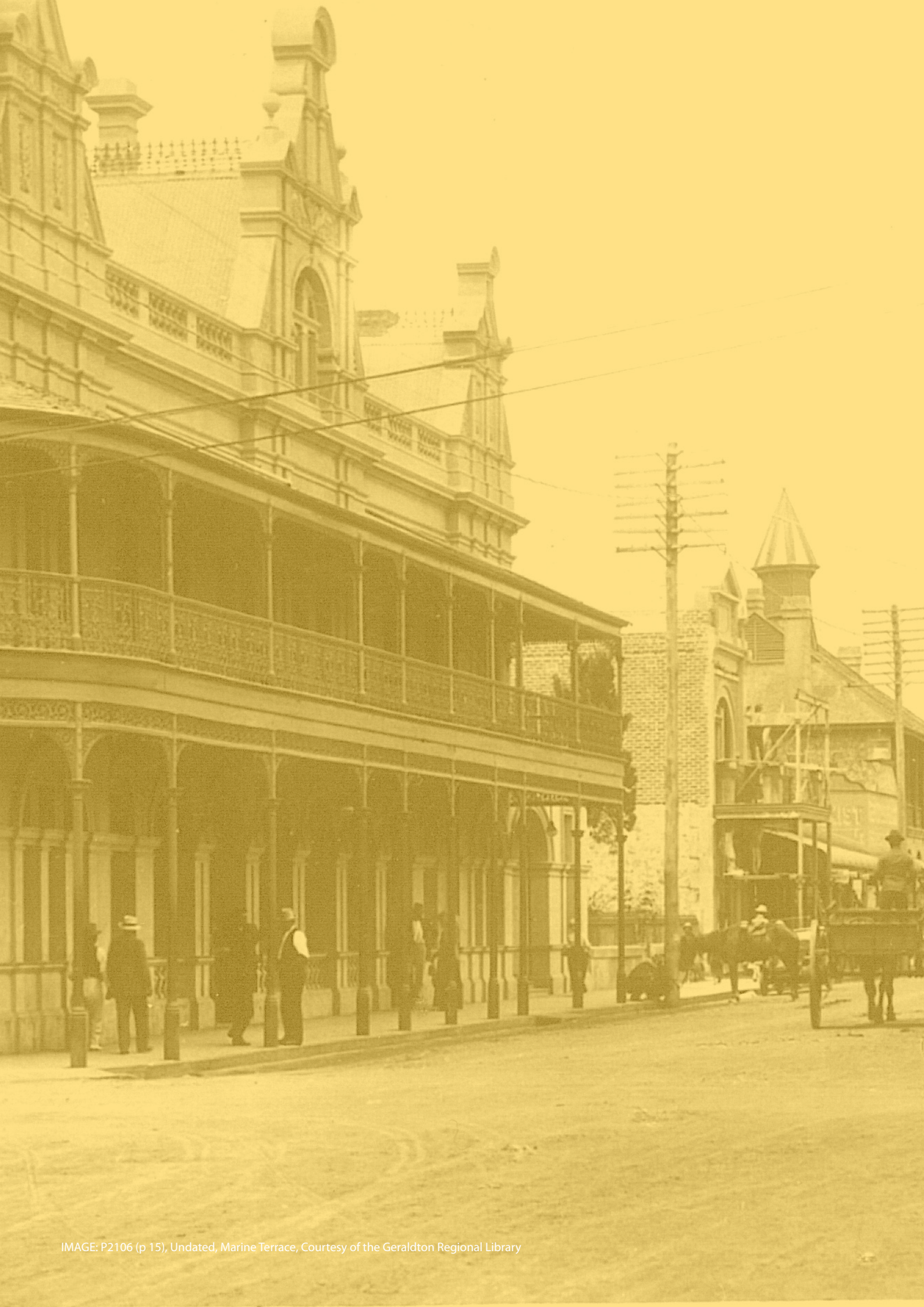
IMAGE: P2106 (p 15), Undated, Marine Terrace, Courtesy of the Geraldton Regional Library