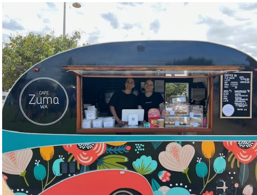
2. Café Zuma

The third submission is from a start-up business identifying an alternative location on the Geraldton Foreshore Reserve 50100. The business concept is not mobile and would suit a lease arrangement aligned with the transportable structures already present along the Geraldton Foreshore. Further internal consultation and investigation into the innovative concept is underway.