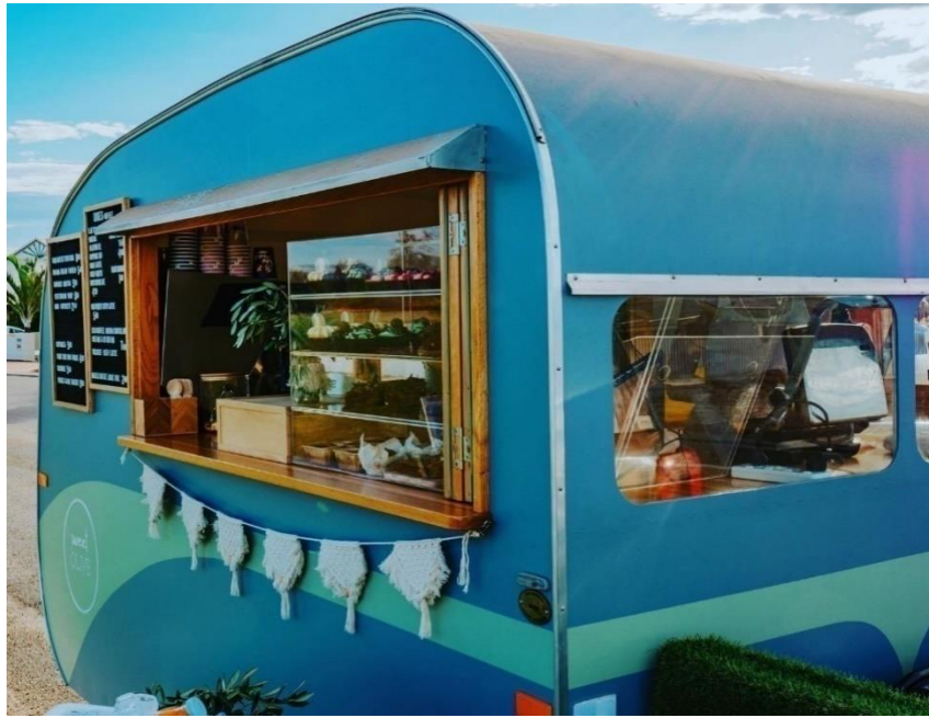
1. Sweet Olive Caravan