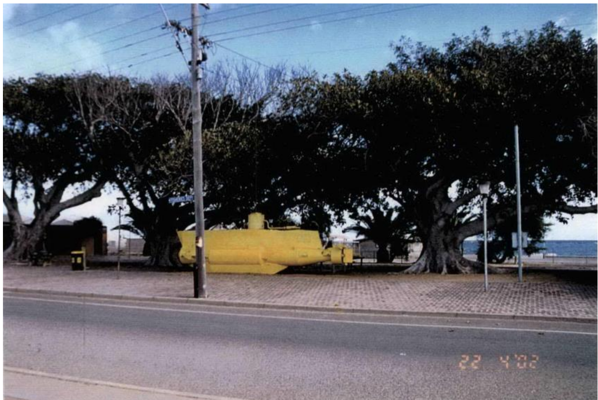
Figure 1 - Yellow Submarine at Marine Terrace early 2000s.

The Rotary Club of Batavia Coast was responsible for the latest restoration works but have been unable to put it back on display. The vessel is being transferred back to the City of Greater Geraldton to find a home for it. The City has undertaken a site selection study for the submarine to identify the most advantageous location for it to be rehomed.