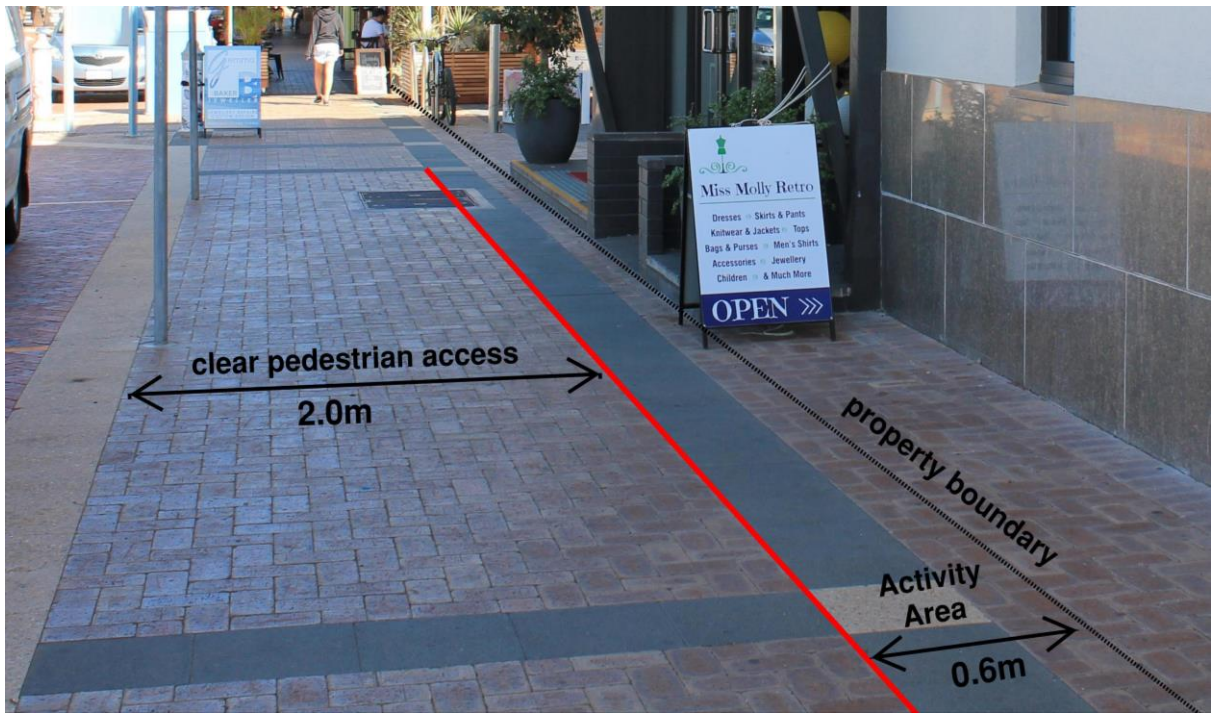
Figure 5 – Marine Terrace northern side from Cathedral to Fitzgerald Street - designated clear pedestrian access location and width.