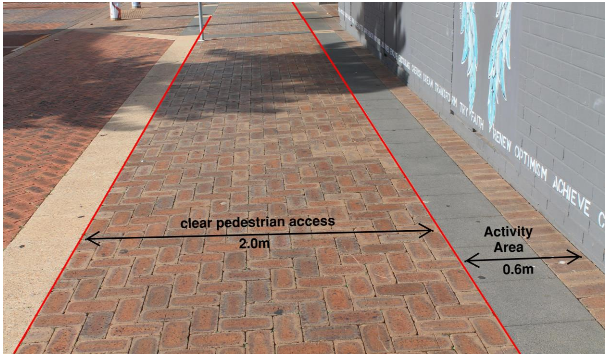
Figure 4 – Marine Terrace southern side from Cathedral to Fitzgerald Street. Designated clear pedestrian access location and width and subsequent area available for approval.