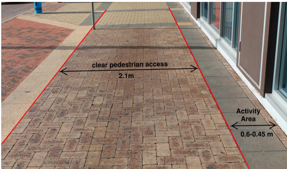
Figure 2 – Marine Terrace from Forrest Street to Durlacher Street. Designated clear pedestrian access location and width and subsequent area available for approval.