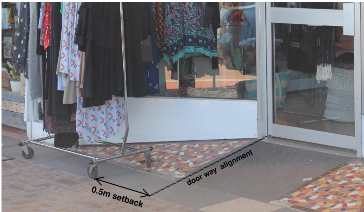
Figure 1 – Required setback of activities, objects and furniture from the door way.