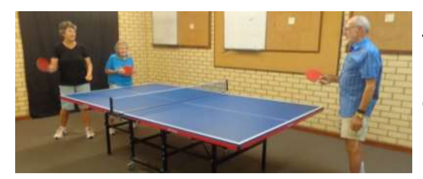
Table TennisMonday afternoons1:00pm to 3:00pmCost is $3.00

Mondays 8:30am -12 noon or 1:00pm - 4:00pm (stay all day if you like) Cost is $3.00 (includes refreshments)