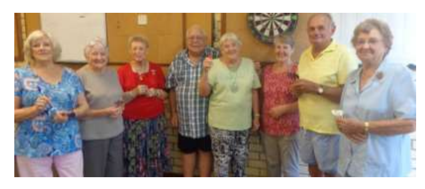
Darts Monday mornings 9:00am to 11:00am Cost is $3.00

Euchre/ Frustration Cards Afternoon Every Friday 1:00pm to 4:00pm Cost is $3.00 Bring a plate & enjoy a wonderful afternoon.