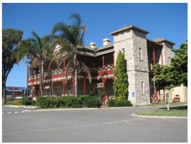
Current Visitor Centre in Bill Sewell Complex

Opportunities for visitors to participate in water based recreational activities could be enhanced by location and or promotion closer to town such as within the redeveloped foreshore precinct.