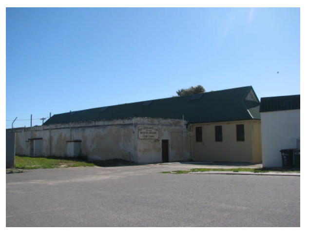
On the Heritage Trail