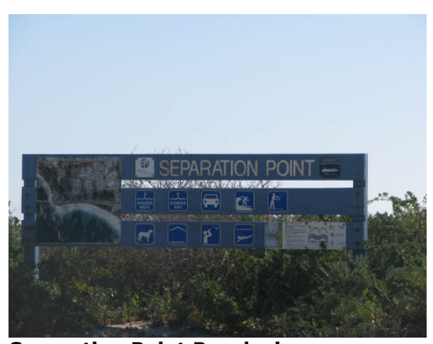
Separation Point Beach signage